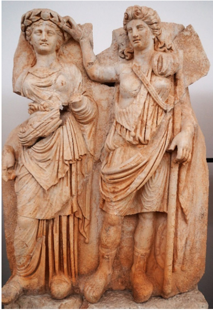
Fig. 11. Panel C17: Aphrodite crowned by Virtus/Andreia. Museum of Aphrodisias.