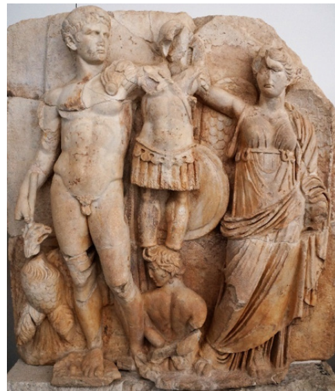
Fig. 1. Panel C2: Augustus and Nike with trophy, eagle, and bound captive. Museum of Aphrodisias.

emperor Tiberius. 6 Sometime after the death and apotheosis of Augustus, the Aphrodisians resolved to monumentalize the street running east-west in front of the temple, adding two marble porticoes flanking the street, known as the Sebasteion (Latin Augusteum ). However, construction on the project continued throughout several principates and was not completed until the reign of Nero. According to the extant inscriptions of the Sebasteion, the complex was dedicated to Aphrodite, to the divine emperors ( Theoi Sebastoi ), and to the people ( demos ). 7 The façades of the north and south buildings were decorated with marble panels carved in high relief on three storeys, each depicting a single figure or a figural group that created a marble tapestry of historical, myth-historical, and mythological narratives. Although the panels do not convey any singular visual program, the themes of war, victory, and the emperors' martial accomplishments make it clear that the iconography of the monument celebrates the virtus , or martial excellence, of the Julio-Claudian dynasty. And because the goddess of military valor and glory, Virtus , often appears on public victory monuments erected during the Julio-Claudian period to symbolize