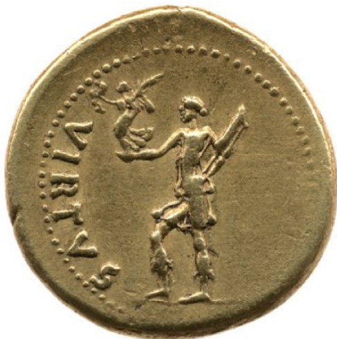
Fig. 12. Aureus of Galba, 69 C.E. Virtus on reverse. British Museum.

Panels C7 and D49 are doubtless images of Roma, the former labeled and the latter represented as the canonical seated-Roma type from the Julio-Claudian period. Because Roma is already represented twice in two disparate forms, it would be unusual and unprecedented to have Roma in Panel C24 and in C17 as two new forms of Roma, totaling four completely incongruent images of Roma without visual consistency or common attributes. Therefore, it is more likely that either Panel C24 and/or Panel C17 represent Virtus/Andreia, whose image would have been familiar to the Aphrodisians, as she was depicted on the Zoilos Monument between Roma and Zoilos. However, the iconography of the goddesses of Panels C24 and C17 does not perfectly correlate with the Julio-Claudian Virtus, nor with the Julio-Claudian seated-Roma type, although many of the physical elements belonging to Virtus are present. The goddess on Panel C24 wears a short tunic underneath her cuirass, which is conventional to the standard iconography of Virtus. Besides her spear and helmet, the prisoner of war at her side alludes to a Virtus (Andreia) identification. As for the goddess on Panel C17, she wears an Amazonian tunic that bares her right breast and carries a spear and balteus to support her sword, suited for Virtus alone. The goddess is also depicted in a Standmotiv – the prevailing physical state of Virtus since the creation of her image during the Republic. It is, however,