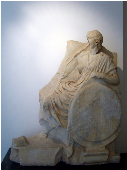
Fig. 8. Monument of Zoilos, ca. 30s B.C.E. Roma, seated next to a shield. Museum of Aphrodisias.

The seated-Roma type is found on a relief from the Sebasteion; however, the image of the goddess has been almost completely erased, likely for a re-purposing that never occurred. Yet, there exist enough contextual elements within the scene to secure the identity of Roma on Panel D49 (Fig. 7). 20 The contour of the erasure demonstrates a seated figure, doubtless Roma, with her legs turned in three-quarter view toward the viewer. The height and shape of the contour of the head suggests that Roma was wearing a helmet, likely crested. A partial diagonal erasure in the upper right suggests that an attribute of the goddess was also eliminated, most likely the goddess' scepter or a spear. The only ascertainable attribute of Roma is the round shield, only partially erased at the lower right-hand corner of the relief. The shield rests against the contour of the base upon which Roma was seated, thereby substantiating the identity of the figure as the goddess Roma. The seated-Roma type was not unprecedented in Aphrodisias. This type also appears on the Monument of Zoilos in the same programmatic frieze as Andreia (Virtus)