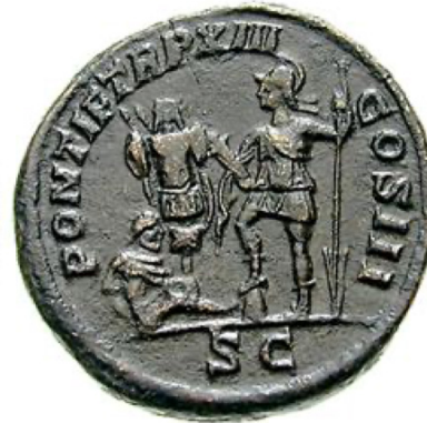
Fig. 10. Dupondius of Caracalla, 210 CE. Virtus, with helmet and spear, standing next to a trophy and barbarian captive. British Museum.

for example, on the so-called Triumphator Relief from the Arch of Titus and on the Triumph Relief from the Medinaceli group, as well as on several issues of imperial coins. 24 If we consider a dupondius minted by Caracalla that depicts Virtus with spear towering over a fettered captive below, then the composition of the coin can be attributed to a common iconographical source that also influenced the military program of Panel C24 (Fig. 10). 25 On Panel C24, Virtus has manifested herself from the conquest of Rome's foreign enemies and from the victory of the emperor – a motif that became increasingly common in the martial corpus of Roman iconography. The fact that Virtus is often represented with the prisoners of war, whether it be a singular composition such as one depicted on the dupondius or a triumphal scene like on the Medinaceli Reliefs, lends credence to a Virtus/Andreia identification for Panel C24. Admittedly, the iconography of this military goddess is a departure from both the Roma and Virtus types of any period. Her singularity can only be explained by craftsmen of the eastern provinces, who created a Virtus/Andreia type from the martial elements which they knew existed in the visual repertoire of military scenes from Rome, namely a goddess with military experience, theoretically having just come from battle dressed in her cuirass, helmet, and a traveler's paludamentum . 26