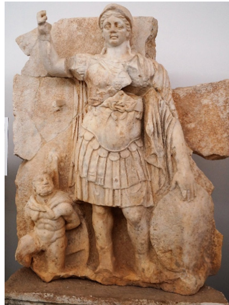
Fig. 9. Panel C24: Virtus/Andreia with barbarian captive. Museum of Aphrodisias.

and Timē (Honos) (Fig. 8). The composition of Roma on the Monument of Zoilos is analogous to the contour of Roma on Panel D49, suggesting that the Monument of Zoilos may have been used as the primary model for the seated-Roma type on the Sebasteion. If the Aphrodisian sculptors of the Sebasteion were drawing on local templates, such as the Roma panel suggests, then the artists would have also been conscious of the allegorical image of Andreia, who stands adjacent to Roma on the monument as the personification of Zoilos' military valor gained during the Parthian incursion that ended in 39 B.C.E. Therefore, creating a monument that recognizes the military victories of the Julio-Claudian emperors from their own foreign wars without acknowledging their virtus , or martial excellence, through the image of Virtus/Andreia would be unreasonable. Thus, there remain two military goddesses illustrated on the Sebasteion who Smith suggests are both Roma. However, at least one (if not both) ought to be considered Virtus/Andreia, whose appearance on a Roman monument celebrating the emperors' martial valor in warfare is expected.