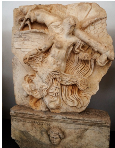
Fig. 2. Panel C9: Nike with trophy. Museum of Aphrodisias.

Not only did the Sebasteion celebrate the victory and virtus of Augustus, but also of the subsequent Julio-Claudian emperors. The victory of the emperors is the subject of Panel C9 from the south building (Fig. 2). A semi-nude Nike majestically flies across the panel, carrying over her left shoulder a robust tropaeum . The base of the relief contains the inscription NEIKH ΣΕΒΑΣΤΩΝ , or "the victory of the emperors." Constructed on a knotted tree trunk, the trophy is composed of a plain cuirass with a simple skirt, a sword in its scabbard attached with a ribbon, and a helmet with a plume. That the trophy