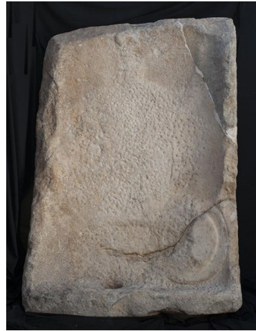
Fig. 7. Panel D49: Roma, seated next to a shield. Museum of Aphrodisias.

on Panel C7 (Fig. 6). 18 Roma towers above Ge, the personification of the earth, who reclines below. Roma is dressed according to the Hellenistic city-goddess type with mural crown and scepter in contrast to her military disposition as helmet-wearer in representations of the goddess in Rome and the west. Her mural crown comprises five towers that rests upon her long, parted hair. Her long chiton with sleeves envelopes her entire body and is tied with a belt high on her torso, just below her bosom. Roma carries a scepter in her right hand and stretches her left toward the right arm of Ge, possibly representing a dextrarum iunctio . Ge, semi-nude, carries a cornucopia filled with an abundance of fruit onto which a small child clings. Although there are no extant parallels to this scene from Rome, the iconography recalls the Kalenus denarius of 70 B.C.E. that depicts four labeled divinities. This denarius not only features the jugate heads of Honos and Virtus on the obverse, but, on the reverse, a standing Roma and Italia are depicted in a dextrarum iunctio . 19 The iconography of Panel C8 is also reminiscent of the Northeast and Southeast Panels of the Ara Pacis, which feature Roma and Tellus Italiae, respectively, both in separate frames, but together within the same visual framework on the eastern wall. However, the Roma from the Northeast Panel of the Ara Pacis is a seated-Roma type,