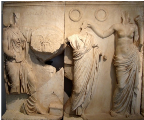
Fig. 5. Monument of Zoilos, ca. 30s B.C.E. Andreia carrying a shield on the left. Zoilos, middle, crowned by Timē , right. Museum of Aphrodisias.

victory wreath (C14, C20, C21); Tiberius with bound barbarian captive (C16); an unidentified Julio-Claudian emperor with trophy and captive (C18); the god of war Ares (C32); and an unidentified cuirassed emperor wearing a paludamentum , ready for battle (C33). 16 Because the iconography of the Sebasteion reliefs commemorate the virtus of the Julio-Claudian emperors through their foreign conquests and martial accomplishments, we should expect that the goddess of the emperors' military excellence, Virtus (the Greek Andreia ), be present within the programmatic composition of this victory monument. Just as Andreia appears on the Monument of Zoilos, equipped with a shield, a balteus to carry a sword, and a helmet, in order to allegorize the virtus of Zoilos as patron and war hero of Aphrodisias (Fig. 5), a similar representation of Andreia would also be appropriate for the Sebasteion in order to represent the virtus of the emperors. 17 Two military goddesses do appear on the façade of the south building; however, Smith identifies both as Roma , thereby portraying Roma on the Sebasteion four times and of four different Roma -types. Four representations of Roma would make the goddess the second most depicted figure on the Sebasteion (after Nike , the high number of which is not unusual, especially in the east), outnumbering