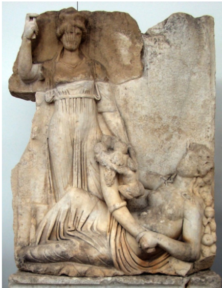
Fig. 6. Panel C7: Roma and Ge. Museum of Aphrodisias.

Of the four representations of the goddess of Rome, two are unequivocally Roma, as one is identified by an inscription and the other is represented by the canonical Julio-Claudian seated-Roma type. Next to Panel C8, which depicts Nero and Armenia, are the goddesses Roma (labeled PQMH ) and Ge (labeled TH )