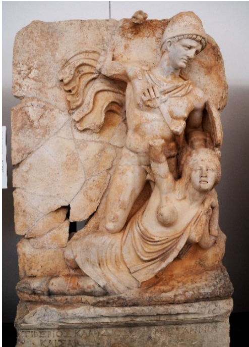
Fig. 3. Panel C10: Claudius vanquishes Britannia. Museum of Aphrodisias.