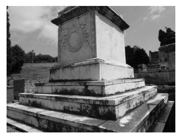
Fig. 9: The altar tomb of Gaius Calventius Quietus, Porta di Ercolano, Pompeii.

The final funerary monument to be discussed is T.52, a house-shaped tomb standing to an impressive height of 3.3 m and measuring 3.3 by 3.15 m at the base of its stepped platform. (Fig. 8) Above the three-stepped platform a series of rectangular upright stones supported a carved cornice, on which