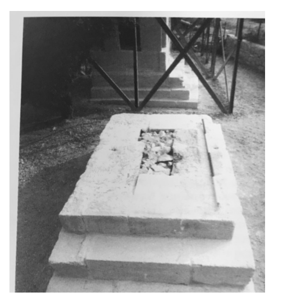
Fig. 7: Burial Monument T.34, Herakleio, after anastylosis, courtesy of Eva Grammatikáki.

grave. Coins were found in eight different graves, ranging in date from the reign of Caligula, 37-41 C.E. (T.3, 8, and 12), to the second half of the first century C.E.,<sup>38</sup> with a coin of Vespasian (69-79 C.E.) being identified in T.2.