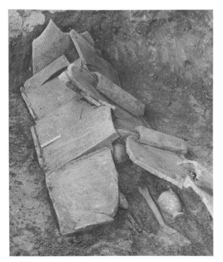
Fig. 6: Tile burial T.6, Potamos cemetery, Agios Nikolaos, courtesy of Dr Costis Davaras.

Trends that can be isolated in the cemetery include the position of the hands over the pelvis and the placing of finger rings on the left hand, a custom that has been identified as beginning in the early Roman period on Crete.<sup>37</sup> Another practice observed at the cemetery was the placing of coins in the mouth of the deceased or elsewhere in the