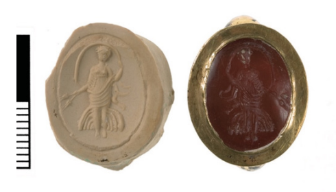
Fig. 4: Detail of gold engraved ring from T.9, Dialektaki field, Ierapetra.

Although the chronology of ceramic and glass evidence has not been published in detail, Apostolakou dates the majority of lamps to the late second through early third century C.E.<sup>12</sup> Finally, coins from the reigns of Hadrian (117-138 C.E.), Antonius Pius (138-161 C.E.) and Septimius Severus (193-211 C.E.) enabled the investigators to refine the chronology of the vaulted tombs to the early second through early third centuries C.E.