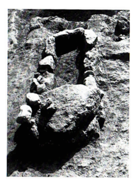
Fig. 5: Tomb 18, Stavros cemetery, Agios Nikolaos.

Meanwhile, Roman Hierapytna and its surrounds have produced evidence of 'intensive exploitation'<sup>19</sup> of the landscape and increased production which demonstrate the means by which an enterprising community may have gained an advantage within the economic framework of the empire. Amphora production,<sup>20</sup> warehouses,<sup>21</sup> possible murex dye production,<sup>22</sup> fish-tanks,<sup>23</sup> farmsteads,<sup>24</sup> and the remains of aqueducts<sup>25</sup> may be cited as indicative of the increased economic capacity of the region's inhabitants during the first two centuries C.E. Finally,