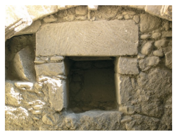
Fig. 3: Internal niche of T.31, Dialektaki field, Ierapetra.

All entrances had been blocked up with large horizontal or upright slabs. Recesses in the interior walls of the tombs suggest the use of timber frameworks to help with the careful construction of the arch.<sup>6</sup>