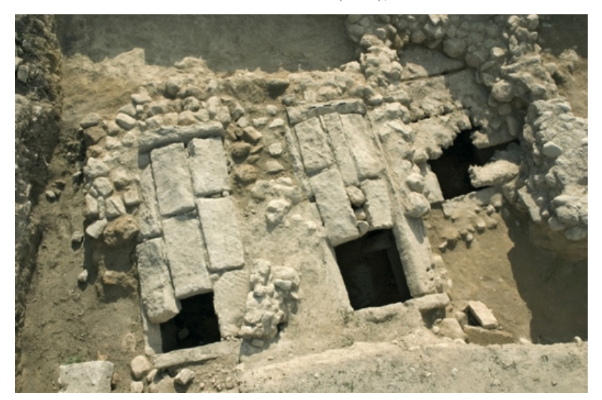
Fig. 2: Vaulted tombs T.24 and 25 from the Dialektaki field, Ierapetra.

Of the 11 single-chamber tombs, seven (Tombs 3, 9, 23, 24, 25, 27, and 28) were built in the pseudo-ashlar style, with their semi-circular arches carefully constructed of five to seven series of carved limestone or gypsum blocks. Three of the tombs included paved floors, some of which had been removed by looters looking for crypts below. The orientation of the tombs was N-S, with an entrance to the north, except for Tomb 27 (T.27), which had its entrance to the south.