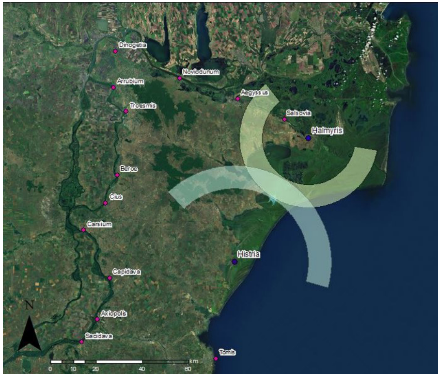
Fig. 3: Five-kilometer buffer for Vallis Domitiana (light green ring in the north) and Ad Salices (dark green ring in the south).

of water. Naturally, the very location of the province of Scythia Minor is governed by two major waterbodies: the Black Sea to the east and the vast Danube River to the north and west. It is clear that the placement of many of the sites is dictated by the rivers and sea as these bodies of water served not only as barriers against external invasions, but also as a rapid means of transport and communication as well as providing a fast means of drainage. There is epigraphic evidence of the existence of a fleet, known as the Classis Flavia Moesica , which was based at Noviodunum and patrolled the Lower Danube. 5 For fortifications that were not located on the coast or the Danube, placement along tributaries or even smaller rivers would have ensured similar benefits.