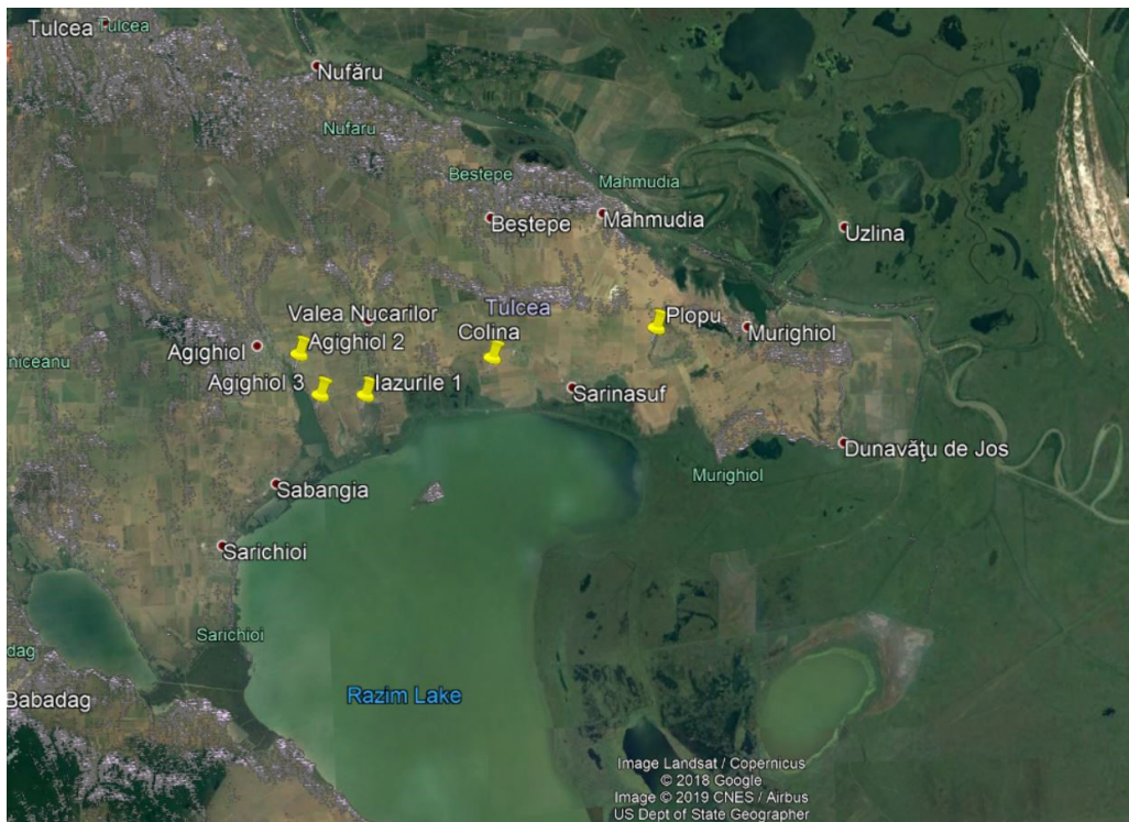
Fig. 6: Sites with Roman material culture identified from field survey.

Unfortunately, none of the areas surveyed within the predicted area of Ad Salices revealed any considerable amount of material culture, but this may be due to a limited degree of access. While the study area for Vallis Domitiana was largely composed of plowed agricultural land, the region for Ad Salices contained considerable numbers of low rolling hills currently covered in dense vegetation and largely inaccessible in the modern day. The model suggests that several of the hills that fall within the study area