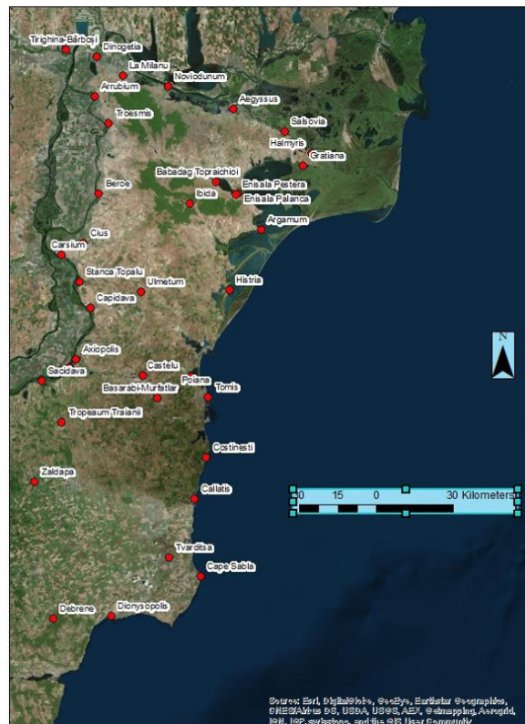
Fig. 1: Fortified sites in Scythia Minor from the 4 th -7 th century C.E.

The fortified installations in Scythia Minor, largely located along the Danube and the coast of the Black Sea, were responsible for the military defense and control of the Roman province. Due to this crucial need for security, the location and placement of the forts must have been a top priority for the Romans in order to ensure the maximum amount of control over the surrounding landscape. Although the fortifications are often separated and categorized by size or function by archaeologists, from smaller towers to larger forts and fortified cities, the purposes of all these constructions