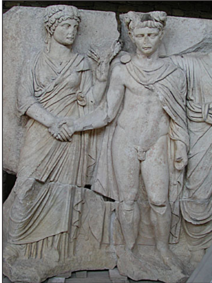
Figure 3: Claudius and Agrippina, South Portico

accomplishments, and the positive changes they brought to the East.