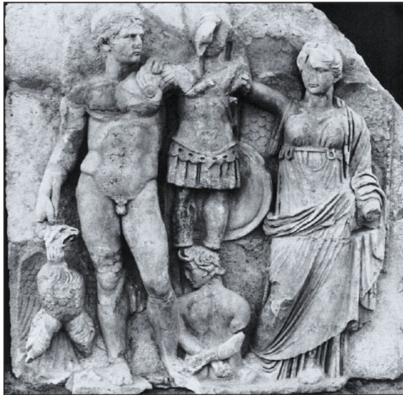
Figure 2: Augustus, Nike, and Trophy, South Portico

leaders were given “honors equivalent to the gods,” or isotheoi timai , meaning that they were venerated and bestowed sacred honors, but acknowledged as mortal men; the key word is ‘equivalent,’ indicating a level of separation between emperor and god. 15