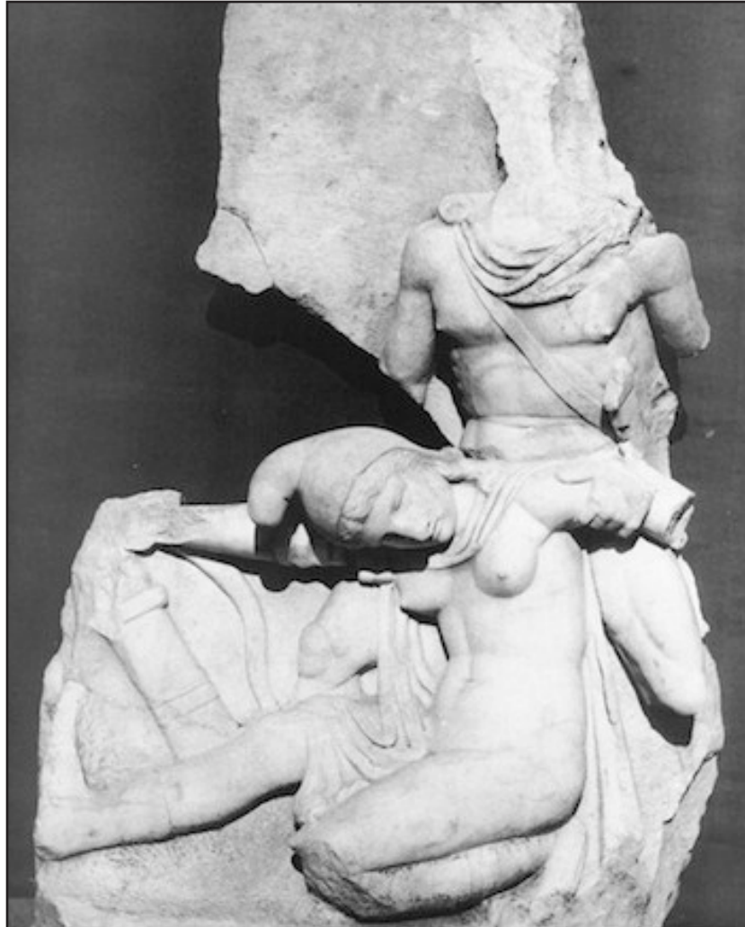
Figure 4: Nero and Armenia, South Portico

and Nike. Augustus holds a scepter in his right hand, which conveyed imperial rule, and his head is decorated with a wreath, most likely made from oak leaves, that signified the emperor's victorious triumphs that saved the lives of the Roman citizens, and referred specifically to the people of the eastern provinces.