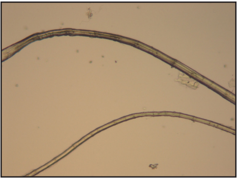
Figure 4: Bast, as viewed under compound microscope. Sample taken from Haukipudas site.