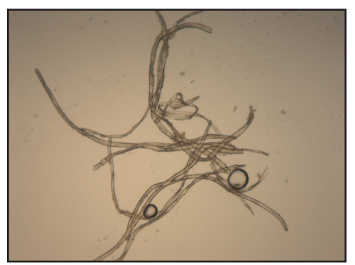
Figure 2: Cotton, as viewed under compound microscope. Sample taken from Haukipudas site.

In addition to the more standard approaches to textile analysis, CT scanning has been utilized for non-destructive analysis of coffin construction, human remains and textile presence. Due to their small size, child and infant burials were ideal for scanning purposes. Several of the subadult coffins were taken in for CT scans prior to reinternment. This offers new nondestructive approaches to textile analysis, in many cases without opening the coffin itself. This non-destructive approach opens up a wide variety of new forms of minimallyinvasive textile analysis for future use.