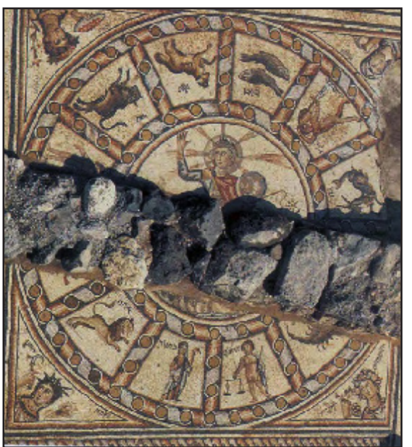
Figure 4: The zodiac wheel in the mosaic floor in the Severan Synagogue (Moshe Dothan, Israel Exploration Society, 1983).

were predominantly treated as a carpet; an extensive surface on which scenes and motifs could be displayed.<sup>14</sup> The main mosaic in the Severan Synagogue consists of three panels (fig. 2), and the bottom-most panel contains eight dedicatory inscriptions in Greek, flanked on either side by lions (fig. 3). The middle panel depicts a zodiac wheel, with images