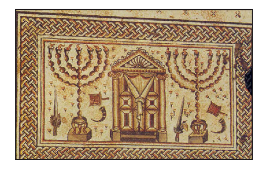
Figure 7a: Torah ark and menorahs mosaic

The uppermost panel of the floor mosaic in the synagogue depicts a Torah ark with an ornamental curtain, flanked by two sevenbranch candelabras, or menorahs (fig. 7a). This imagery appeared in both Jewish and Samaritan synagogue mosaics, and also in bas-reliefs and ritual objects.<sup>22</sup> This part of the mosaic also contained other important Jewish symbols, such as a coal pan (fig. 7b), the shofar (fig. 7c) a horn made from a ram's horn used during the Jewish holiday of Rosh Hashanah – and a ceremonial palm frond, or lulav branch, with its accompanying citron, or etrog (fig. 7d), used during the holiday of Sukkot. These features commonly appeared together in imagery from Palestinian and diaspora communities, and distinguished representations of Jewish menorahs from Samaritan ones,23 which were otherwise similar, due to the fact that there was a population of Samaritan Israelites.<sup>24</sup>