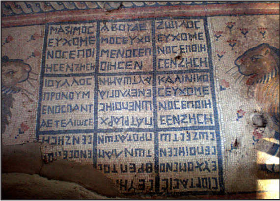
Figure 3: The eight-panel Greek dedicatory inscription in the mosaic floor of the Severan.

Within the Severan Synagogue, a remarkable floor mosaic was discovered, one of the most impressive in the country. The majority of mosaics found in Tiberias and Hammat date from the third through the mid-eighth century C.E., many of them inlaid into floors. Floors