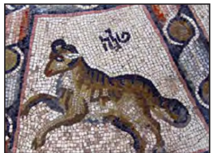
Figure 5a-d (top to bottom): Aries, Taurus, Gemini, Leo (Photograph by Shulamit Miller).

The zodiac signs have elaborate coloring, and are rendered in fine detail, an effect achieved through the use of small tesserae. The Aries sign is depicted as a ram, mid-leap, with a luxuriant tail (fig. 5a); the Taurus as a charging bull, tail upright (fig. 5b); one of the twins of the Gemini sign has been lost, but the preserved twin is a male youth with brown hair, standing nude (fig. 5c); the Leo sign is depicted as a roaring, pouncing lion (fig. 5d); Virgo as a maiden standing with a torch ablaze in her left hand, wearing a long, red tunic, with a gray mantle over it (fig. 5e); Libra is a young, standing male, nude, save for a gray cape over his shoulder, holding a scale in one hand, and a golden scepter in the other (fig. 5f); the Scorpio sign, though half-destroyed, remains as the posterior of a darkly-colored scorpion (fig. 5g); Capricorn is depicted as a creature with the head, torso, and front legs of a goat, and the rear haunches and tail of a fish (fig. 5h); the Aquarius is a standing, nude male youth, leaning back and pouring water out of a large golden jug from over his shoulder (fig. 5i); the Pisces is depicted as two similar-looking fish, swimming past each other in opposite directions (fig. 5j).