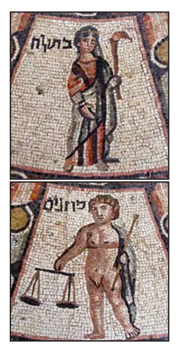
Figure 5e-f (top to bottom): Virgo, Libra

These mosaics are of particular importance as well because it is the first time that Jews are known to have used the zodiac in their synagogue decorations.16 The use of the zodiac wheel was quite common in ancient synagogues, as there are many examples, but less common was the representation of the pagan sun god Helios in the center (see fig. 4); to date, only seven zodiac panels incorporating Helios have been uncovered, all in synagogues, all within Israel.<sup>17</sup> While every other element in the mosaic is labeled, Helios is the only element that is not, perhaps expressing some discomfort of the use of this borrowed iconography.<sup>18</sup> The god is depicted as a magnificent figure, crowned with a halo, and protruding seven rays of light from his head. His right hand is raised, as if waving, and he holds in his left hand a globe and a whip. He is flanked on either side by the moon and a star, which, given the context, could be seen as either the Sun or just a star in general. He wears a long-sleeved blue