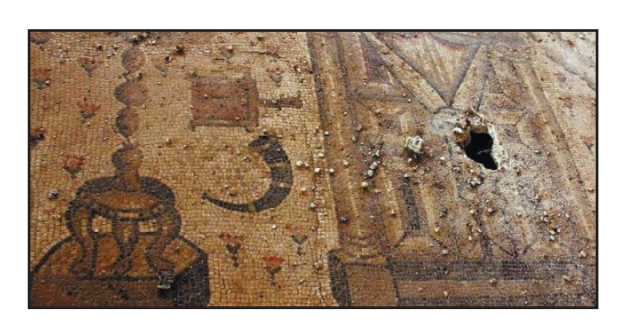
Figure 11: Hole drilled in Torah ark mosaic.