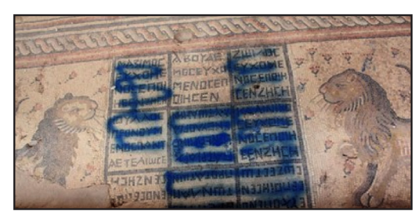
Figure 8 (left): Spray paint over the inscription mosaic.