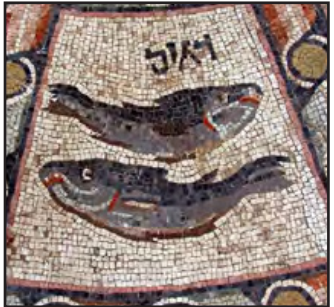
Figure 5g-j (top to bottom): Scorpio, Capricorn, Aquarius, Pisces