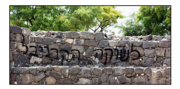
Figure 10: Spray paint on the synagogue walls.