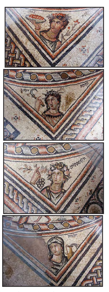
Figure 6a-d (top to bottom): Spring, Summer, Autmn, Winter

The mosaic floor at this synagogue was executed some time in the 360s C.E. by a workshop of the highest class, brought to Israel from one of the great metropolises of the Roman Empire, possibly Alexandria, Nea Paphos, Antiochia or Apamea.<sup>20</sup> According