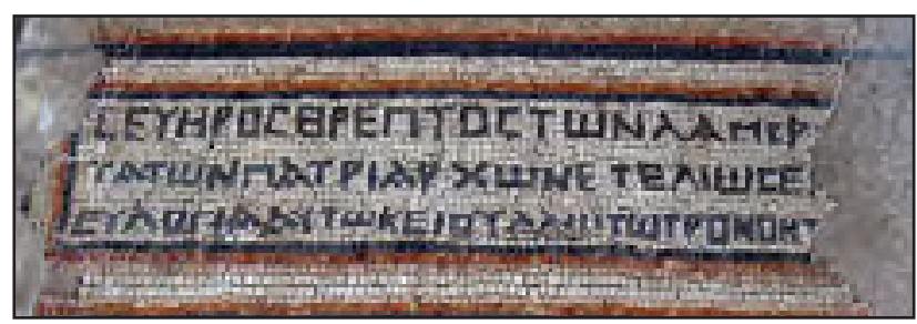
Figure 1: The Greek dedicatory inscription in the mosaic floor on the Eastern side of the Severan Synagogue.

Of the thirteen synagogues that once stood in Hammat Tiberias, two have been excavated. The first was uncovered in 1921 by writer and translator Nachum Slouschz. The excavation of this temple was a watershed event in the history of Israeli archaeology, as it was the first synagogue excavation conducted under Jewish auspices. The number of excavations