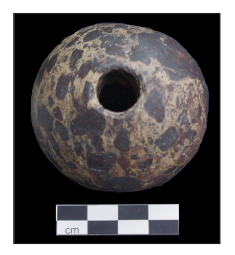
Figure 4: Macehead from Trench 5, Çatalhöyük West