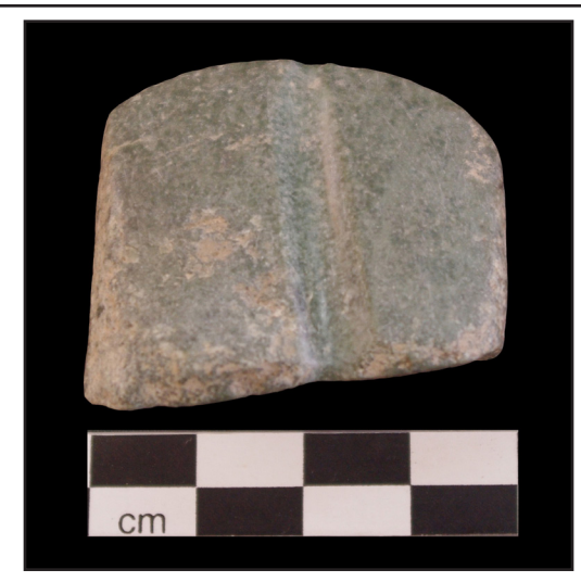
Figure 3: Serpentinite Grooved Axe Bit