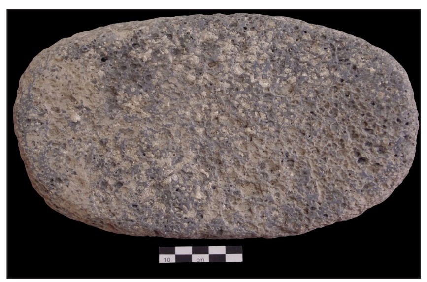
Figure 2: Andesite Grinding Handstone

(0.85%, n=3), and diabase (1.14%, n=4) make up the rest of the igneous rocks.