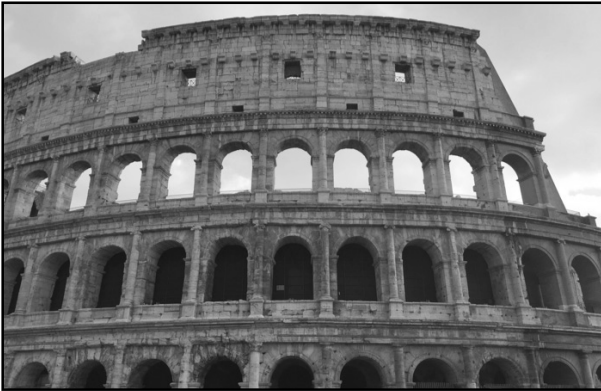
Figure 2. Flavian Amphitheater, Rome - commissioned by Emperor Vespasian and inaugurated by Emperor Titus in 80 C.E.

Through a close reading of Martial's epigram on the execution of the criminal-as-Orpheus, this paper examines what was at stake for both the audience and event sponsors in the mythological-themed executions held within the amphitheater. 10 I first situate these executions within the larger frame of amphitheater games, particularly in relation to non-mythological public executions, to demonstrate how these Greek-inspired executions represent a significant divergence from the norm. Secondly, I offer a visualization of Martial's epigram on Orpheus and consider the implications of the myth's reinterpretation for its new venue. Finally, I explore how and why Romans sanctioned Greek entertainment tropes in a distinctly Roman-coded venue by contextualizing the mythological execution within the construction, use, and ideology of the architecture of the Roman amphitheater. I argue that by transforming the public execution from what was formerly a rudimentary event without fanfare, prior to 80 C.E., into a theatrical production predicated on surprise and amazement, Romans not only participated in and reinforced —whether actively as a sponsor or programmer or passively as an onlooker — control of the