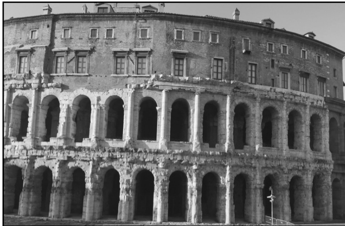
Figure 3. Theater of Marcellus, Rome - 13 BC - started by Julius Caesar and inaugurated by Augustus.

The rise of imperial rule following the reign of Augustus coincided with the proliferation of a new form of entertainment space: the amphitheater. 60 Theaters, due to restrictions in space, seating, and technology, seem to have become inadequate sites in which to house the increasingly massive imperially sponsored games. 61 The amphitheater adopted the semicircular seating of the theater and expanded it into a circular arrangement, so that performers and spectators alike were visible from all angles. 62 This new emphasis on sightlines in the amphitheater was in opposition to the restricted viewing of the Greek theater, where all audience members unilaterally observed the actors in front of them. 63 By erecting an exceedingly vast and prolific structure, such as the Flavian Amphitheater, with which to house the increasingly popular imperial blood sports, the Flavians signaled a new era simultaneously characterized by the