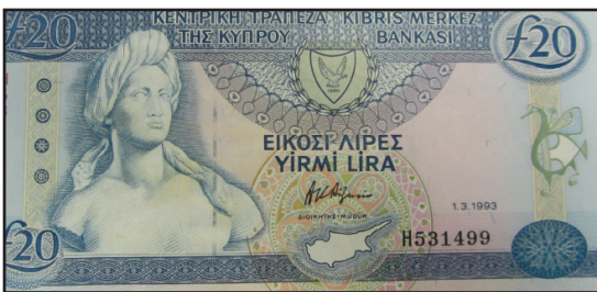
Figure 6: The obverse side of the 20-pound note of the 1992 series decorated with a first century sculpture of Aphrodite from Soli.