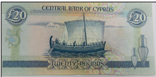
Figure 7: The reverse side of the 20-pound note of the 1992 series decorated with the Kyrenia ship, two amphorae and Petra tou Romiou in the background (photo: C. Alexandrou).

controlled Cyprus. Although the occupied regions were replaced, there are some indirect references to the northern part. For example, Potamia and Peristerona villages are located close to the Green Line which separates the government-controlled Cyprus from the area under the Turkish occupation. In addition, the monuments chosen to serve as indices for the Peristerona village are a Greek-Orthodox church and a Turkish mosque; this might