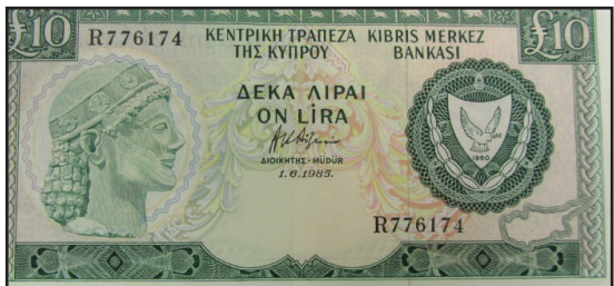
Figure 4: The obverse side of the 10-pound note of the 1977 series decorated with an athlete's head of the Archaic period.

The replacement of some designs deserves further discussion. Arsos, Bellapais and Salamis represented by monuments or objects of material culture were replaced by equivalent figures illustrating the villages of Potamia, Kato Drys and Peristerona; the former are located in the occupied part of the island while the latter in the government-