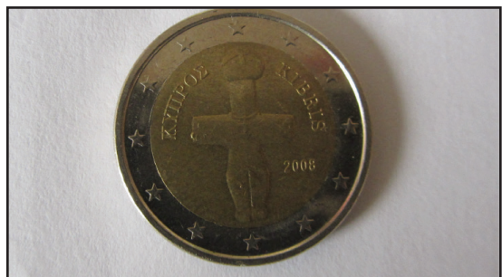
Figure 8: The obverse side of the two-euro coin decorated with the so-called “Pomos idol”.

The high denominations one and two euro carry the so-called “Pomos idol,” a cross-shaped picrolite figurine 35 (fig. 8). It dates back to the Chalcolithic period and it is considered a characteristic sample of the prehistoric art of Cyprus. 36 Contrary to the symbols used on earlier issues, the choice of this topic derives from the prehistory of Cyprus. It not only represents the long history of the island but, more importantly, promotes a clear, Cypriot identity.