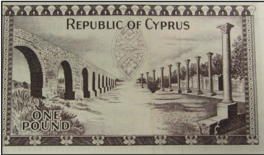
Figure 1: The reverse side of the one-pound note of the 1961 series decorated with the Ottoman aqueduct; opposite, the colonnades of the Roman palaestra in Salamis.

palaestra) of the gymnasium at Salamis 9 (fig. 1). These buildings are presented opposite to each other. Even though the palaestra dates to the Roman period, its architecture derives from the Greek models and it could have served as a subconscious connotation of a Greek past. The placement of the two monuments together on the banknote may have served as symbols of the co-existence of the two communities of Cyprus, the Greek-Cypriots and Turkish-Cypriots. They are also monuments that confirm their roots on the island. These icons may have been a message to both sides since their relationships had been tense since 1955 and became worse in 1963 when there was an outbreak of inter-communal violence.