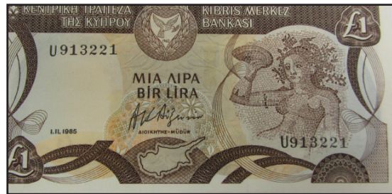
Figure 2: The obverse side of the one-pound note of the 1979 series decorated with the nymph from a mosaic from the House of Dionysus in Nea Paphos.

In 1997 changes occurred in the character of the themes decorating a number of the banknotes of the previous issue. The themes related to the Cypriot past are now balanced by themes inspired by the folk life, flora and fauna and the various regions of the island. The nymph from the mosaic pavement depicted on the one-pound note was replaced by an icon of a Cypriot girl dressed in the traditional costume, while the Bellapais Abbey was replaced by a representation of the village Kato Drys. The limestone portrait of Arsos on the obverse side of the five-pound note was replaced by the limestone head of a young man dating to the fifth century B.C.E. found in the area of Potamia village. The Salamis theatre on the reverse side of the five-pound piece was replaced by the Greek-Orthodox church and a Turkish mosque from the village of Peristerona. Moreover, the Archaic athlete's head on the obverse side of the 10-pound note was replaced by the marble head of Artemis of the Roman period found in Paphos. It is significant to note that apart from these modifications, the rest of the symbols and icons on the 1997 banknotes remained the same as in the previous issue. 24