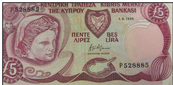
Figure 3: The obverse side of the five-pound note of the 1979 series decorated with a limestone portrait head from Arsos.